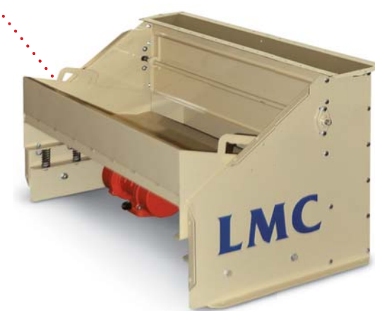
OPTIONAL VIBRATORY FEEDER PAN

The in-feed pan introduces the product into the air stream. The feed rate can be adjusted using a vibratory feeder option or slide pan option.