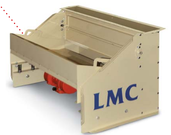
OPTIONAL VIBRATORY FEEDER PAN

The in-feed pan introduces the product into the air stream. The feed rate can be adjusted using a vibratory feeder option or slide pan option.